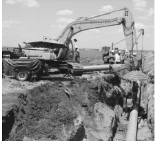
Gas gathering pipe is laid as part of the CO 2 flood expansion at Sacroc, expected to add 234 million bbl of oil production.

These practices for achieving miscible CO 2 flooding have increased production to relatively new highs. The miscible process appears quite healthy (Figure 1). The unit has increased production nearly 50% in the past 2 years under the new operator. The operator's miscible CO 2 flooding approaches are expected to recover an